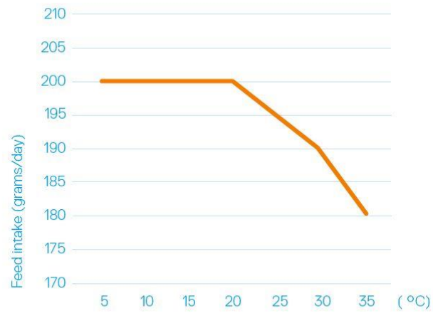
Figure 1: Feed intake per broiler related to house temperature (day 42 of life).